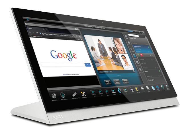
MT-2002 (FG5969-35) Panoramic Tabletop Touch Panel