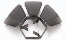
Three MTC-xxH* as Cluster Module Bracket